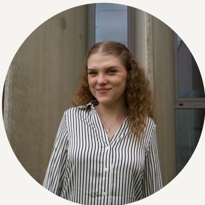
Flavia Villafani Undersecretary of Logistics